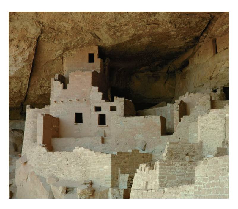
Archaeologists try to reconstruct the cultures of past societies like those who created this "Cliff Palace" in what is today Mesa Verde National Park.

ETHNOLOGY (CULTURAL ANTHROPOLOGY) The subfield of ethnology, now commonly called cultural anthropology, seeks to understand how and why peoples today and in the recent past differ or are similar in their customary ways of thinking and acting. They ask how and why cultures develop and change and how one aspect of culture affects others. Cultural anthropologists seek answers to a variety of questions, such as: Why is the custom of marriage nearly universal in all cultures? Why do families live with or near their kin in some societies but not in others? What changes result from the introduction of money to a previously nonmonetary economy? How are relationships impacted when family members move far away to work? What happens to a society that suffers severe stress because of natural disasters or violent conflicts? Although the aim of ethnologists is largely the same as that of archaeologists, ethnologists generally use data collected through observation and interviews of living peoples.